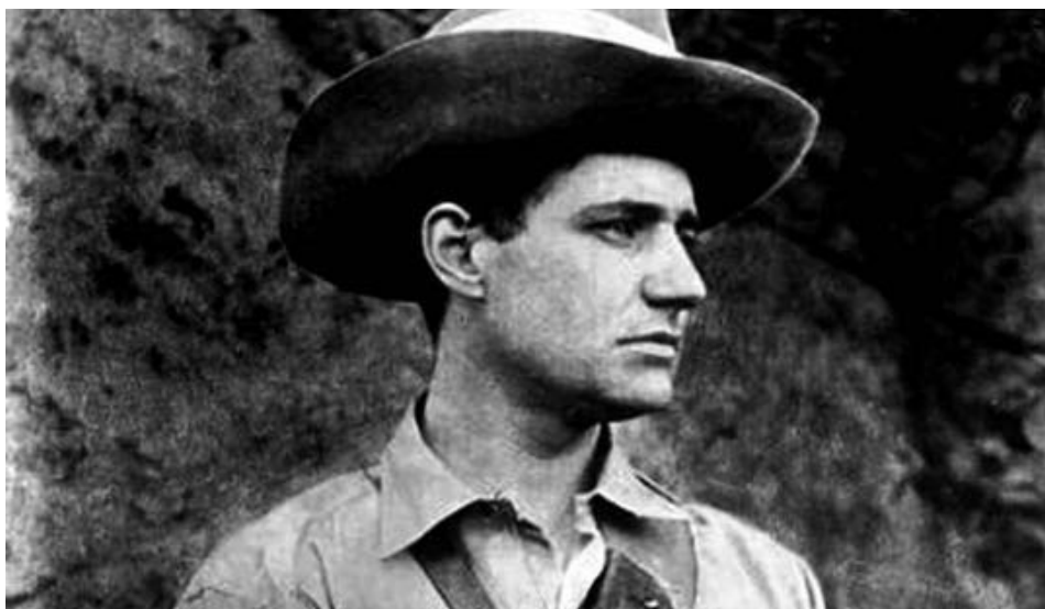
Captain Fritz Duquesne as a Boer soldier in 1900. - Reprobate

Duquesne is verskeie kere deur Britse magte gevang en in aanhouding geneem, maar het elke keer ontsnap.